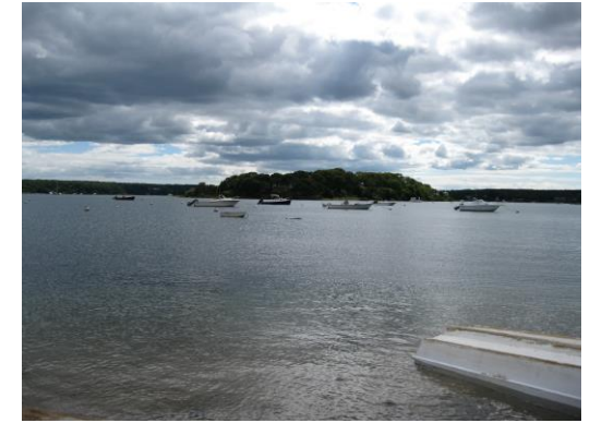
[A view of the Lagoon Hine's point straight ahead]

Accidents must report to the MA Environmental Police